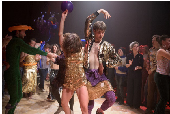
Ballrooms 2023