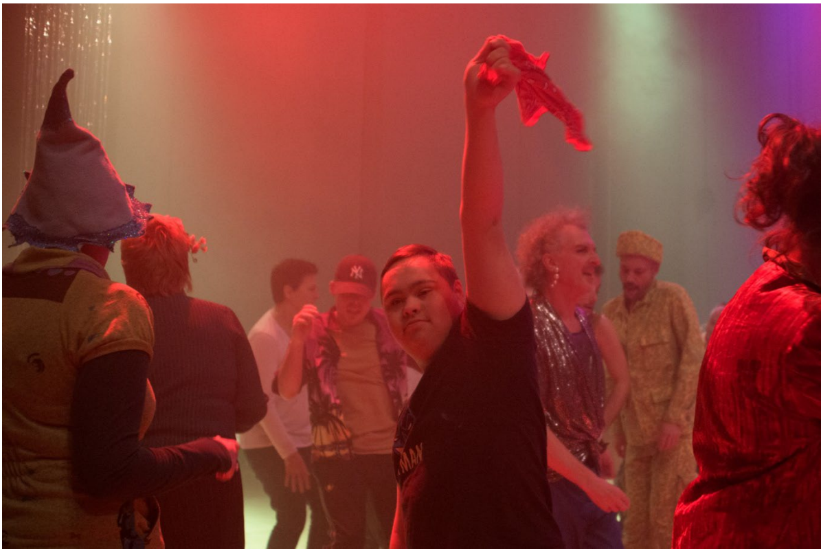
Ballrooms 2023