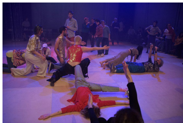
Ballrooms 2023 | © Sofie De Backere