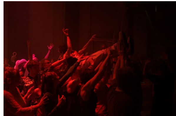
Ballrooms 2023