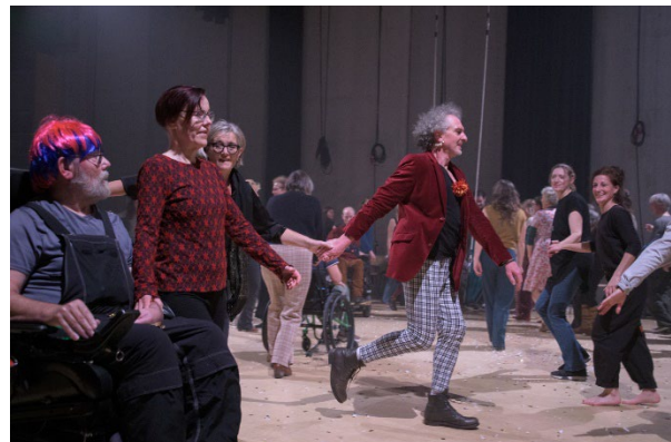
Ballrooms 2023